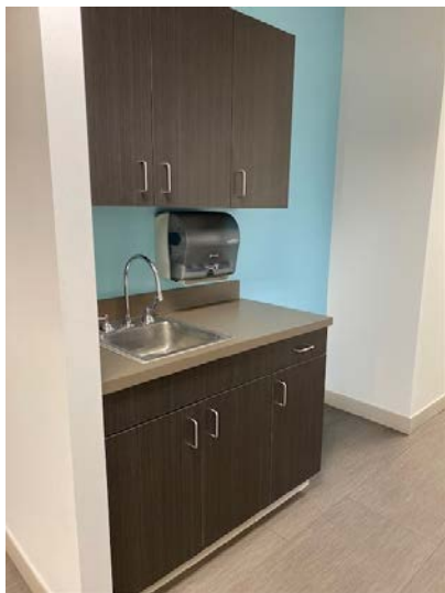
One of several wash areas