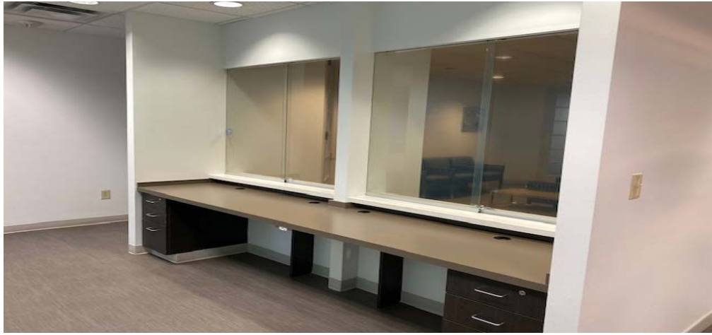
Patient Check-In Facing Reception Area