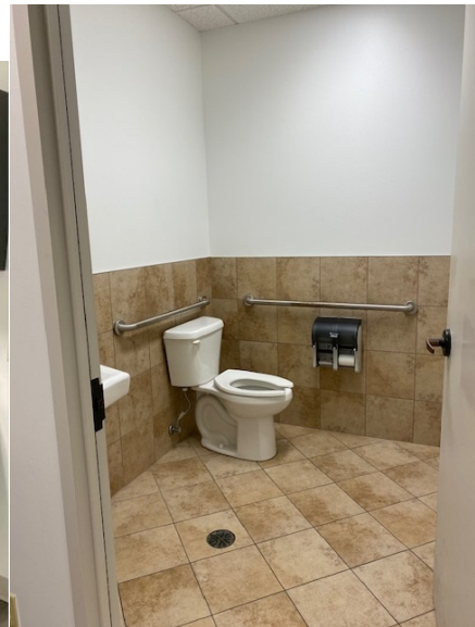
One of several in-suite restrooms