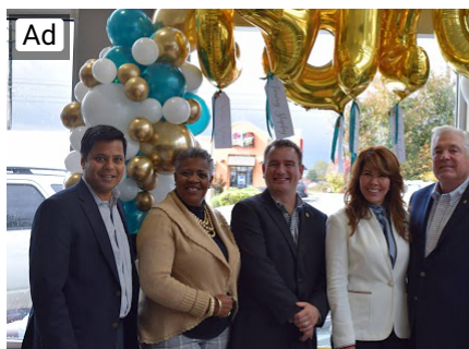
Public Relations Agency

Transportation firm Alto also rents office in the Manufacturing District.