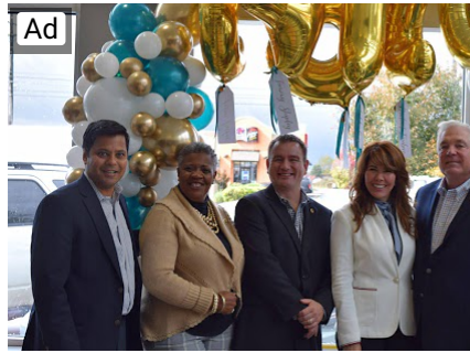
Public Relations Agency